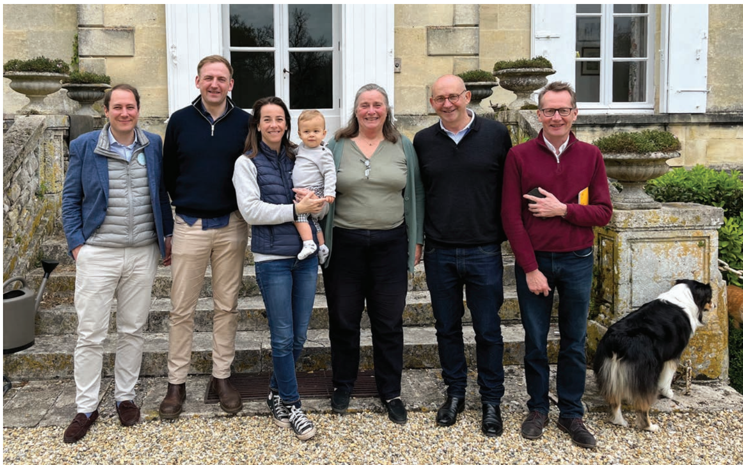
Three generations of the Barton family

To order, visit thewinesociety.com/bordeauxep or call 01438 741177